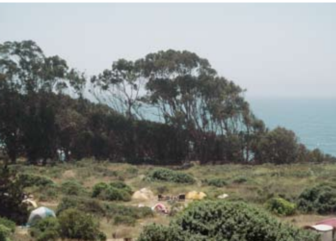
Walk-in campsites at Manresa State Beach

picnicking on the beach, and unmatched views of Monterey Bay make Sunset State Beach a favorite year-round destination. Manresa State Beach rewards visitors with sweeping views of bluff-backed sand and sea, with the Santa Cruz Mountains to the northwest and the forested hills of the Monterey Peninsula to the southwest. Sunset and Manresa state beaches are approximately one mile apart off Highway 1.